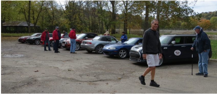
is at Ye Olde Mill at Velvet Ice Cream at Utica, OH