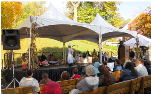
was the festival princess competition.