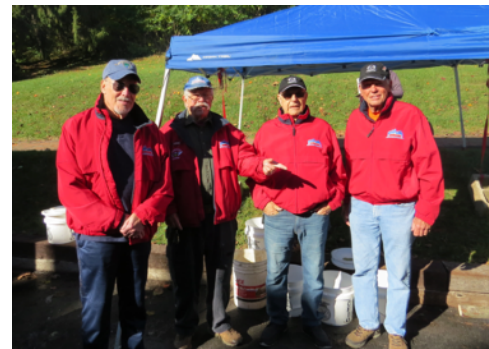
shows four travelers at the Apple Butter Stirrin' at Ridgeview FFA