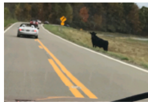
We encountered the cow on our way home Sunday. She seemed to be enjoying our parade.