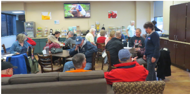
is the drivers' meeting in the hotel lobby on Saturday morning