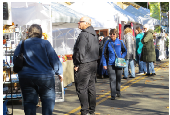
shows the Festival in Roscoe Village