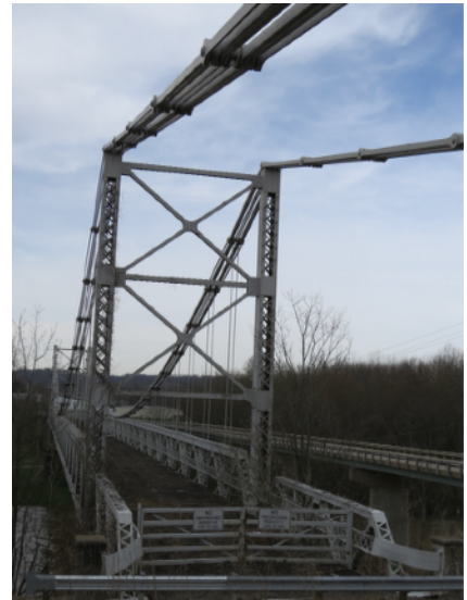
is the "chain" bridge at Dresden