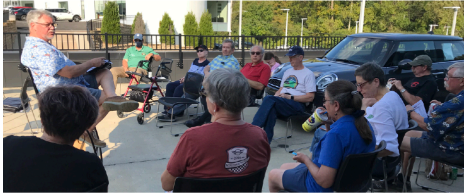
Fall Spirits Drive

October 9 motor in at Cincinnati Mini's terrace. Nominations made for officer positions.